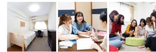
Flat Study Room Common Room

留学生は滞在全期間、本学所有の学生寮(徒歩圏内)に滞在します。寮にはレジデント・アシスタント(RA)が同居し、留学生をサポートします。